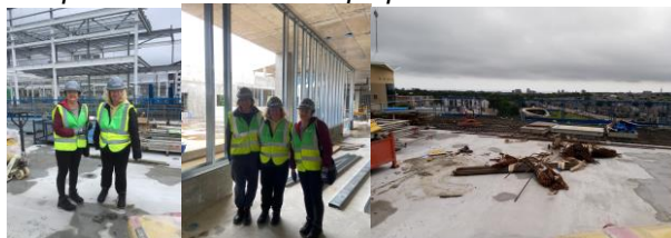
Baird site visit